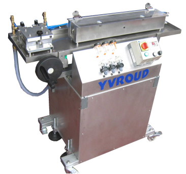
Profil calibration table model BCP1000 length 1 m