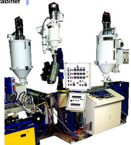
Coextrusion configuration diameters 25, 40 and 60 mm