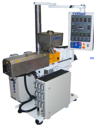
Various coextruders diam 18 to 30 mm With separated or stand on electrical cabinet