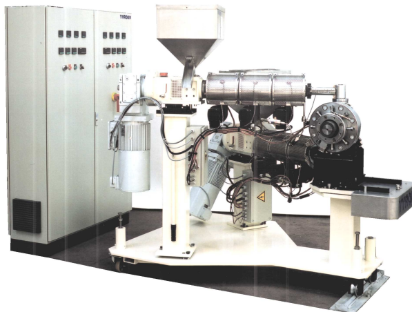
Coextrusion configuration 2 x diameter 30 mm