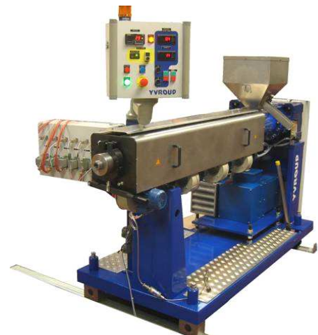
Customised Extruders and Renovated Extruders