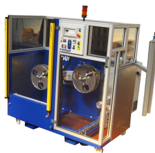
On line cutting Unit Automatic Coiler