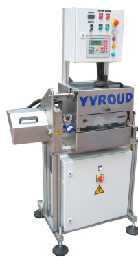
Conveyors and special machines