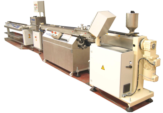
Extruders diamètre 20 to 40 mm

YVROUD has solidly established its presence in the medical sector for several decades, constantly upgrading its equipment in collaboration with its customers, ensuring it meets the latest market requirements.